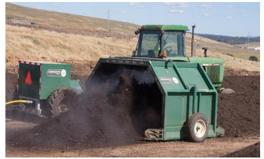
Photo: Household FOGO waste is converted into nutrient-rich compost.