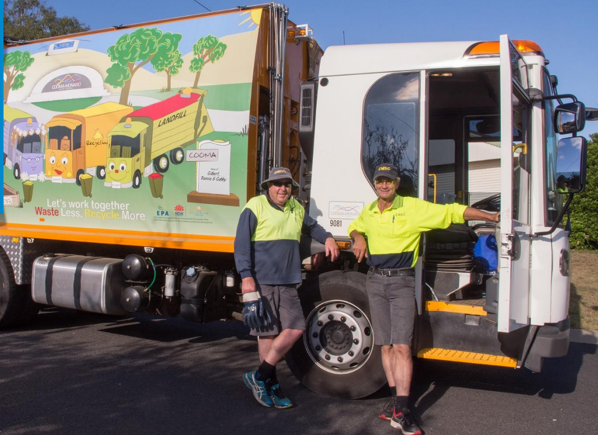
Photo: Fun branding is used to educate children about waste and sustainability.

Home to a population of 10,114 people, the Cooma-Monaro area in south-east NSW is set among the rolling Monaro plains and Snowy Region peaks about 100 kilometres south of Canberra.